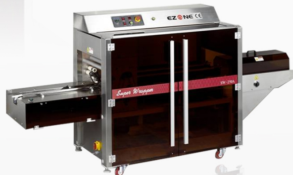
Stainless steel cover