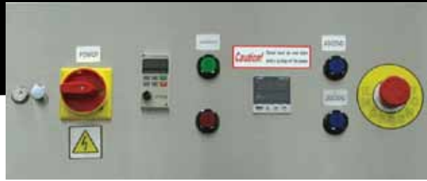
Digital Control Panel