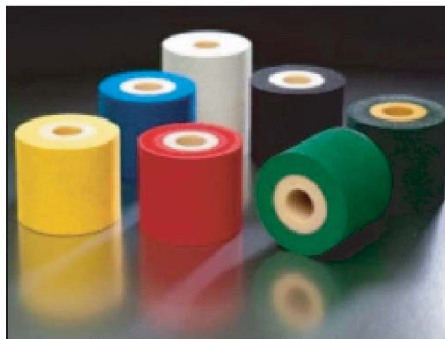
Hot Ink Roller