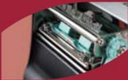
Modular concept printhead