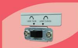
Rotating Direction Switch