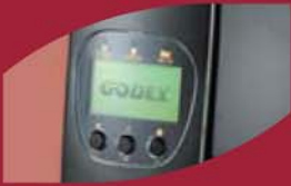
Upgraded Graphic LCD