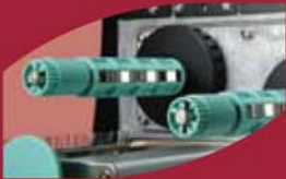
Ribbon supply and rewind module