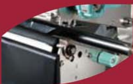
Adjustable sensor kit