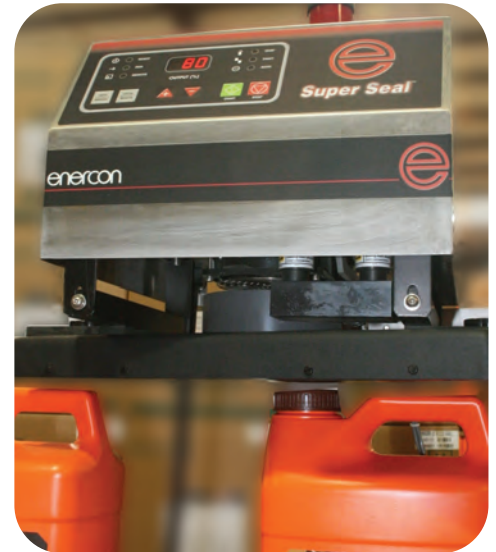
Super Seal™ securely seals a vented liner to prevent leaks and bloating.

A cap which contains a tiny 0.188" hole allows the container to vent while still repelling the liquid product.