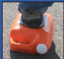
Vented liner passes test