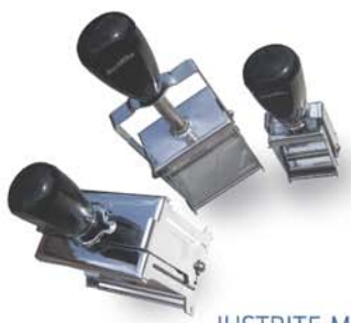
JUSTRITE M.31 Self-Inking Stamp