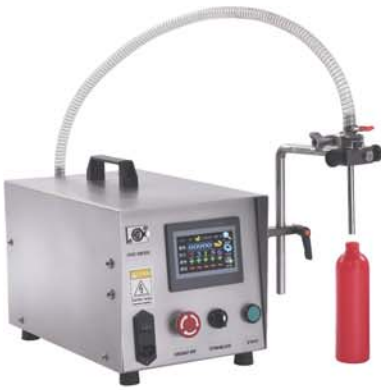
FG-120 TableTop Gear Pump Liquid Filler