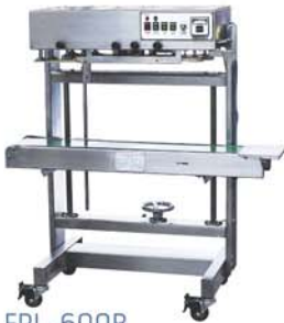
FRL-600B Vertical Band Sealer