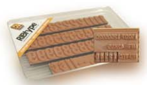
Metric RIBtype® THE RIBTYPE® SYSTEM