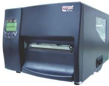
EZ Series EZ-6300Plus Plus Barcode Printer