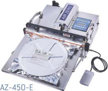
AZ-450-E DeskTop Nozzle Type Vacuum Sealer