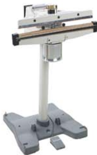
PHS-Series Semi-Auto Sealing Machine