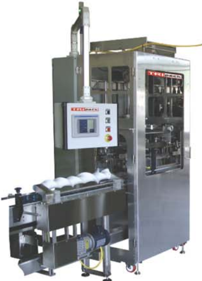
HSA Series Shrink Sleeve Applicator