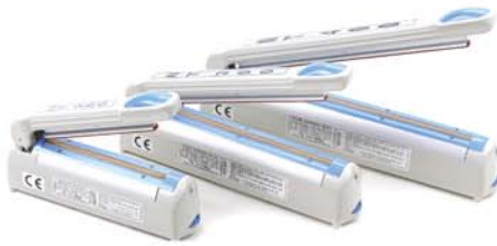
PHT-Series Hand Sealing Machine