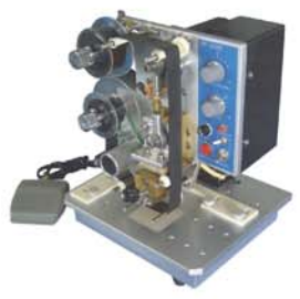
DK-200 Desktop Hot Foil Printer