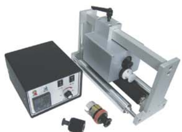
DK-800 Hot Foil Printer