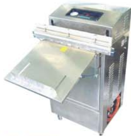
DZ-600W Nozzle Type Vacuum Sealer