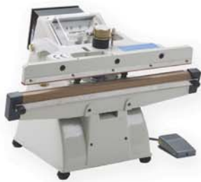
PHA-Series Auto Sealing Machine