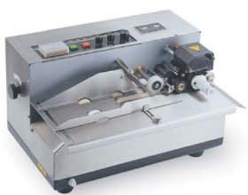
DK-300 Table Top Imprinter