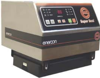
Super Seal 100 Induction Cap Sealer