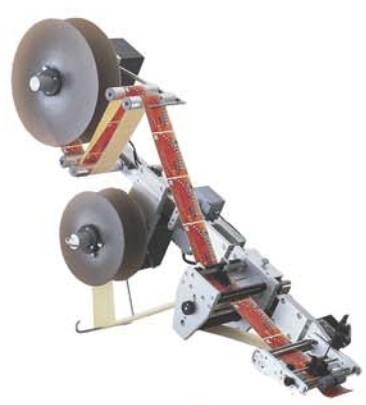
Collamat® 9100 High Performance Labeling System