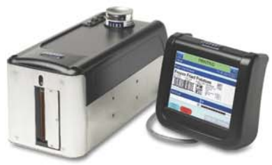
LINX IJ375 Large Character Printers