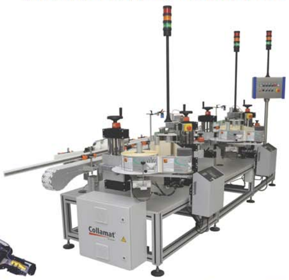
Collamat® L100 Wrap Around Labeling System