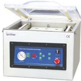
DZ Series Chamber Vacuum Sealer