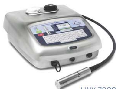
LINX 7900 Continuous Ink Jet - CIJ