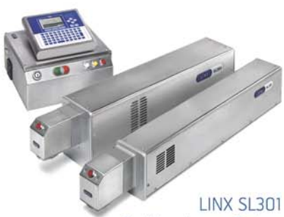
LINX SL301 Scribing Laser Coders