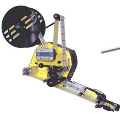
Collamat® NG Series Flexibility Labeling System