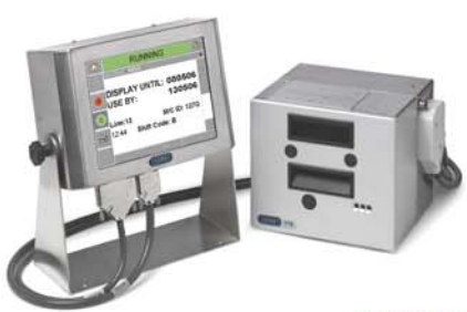
LINX TT5 Thermal Transfer Overprinter