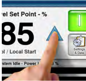
Simple Touch Screen