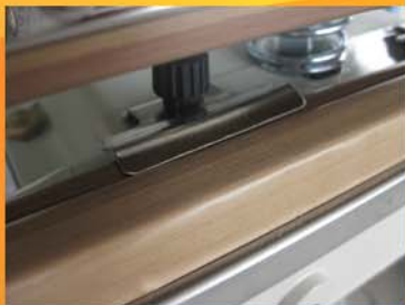
Teflon Cloth Holding