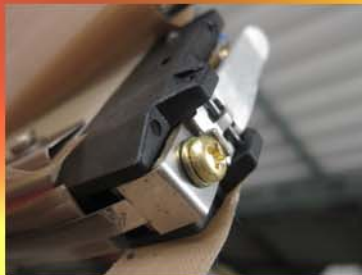
Heating Wire Holder