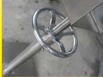
Stand level wheel