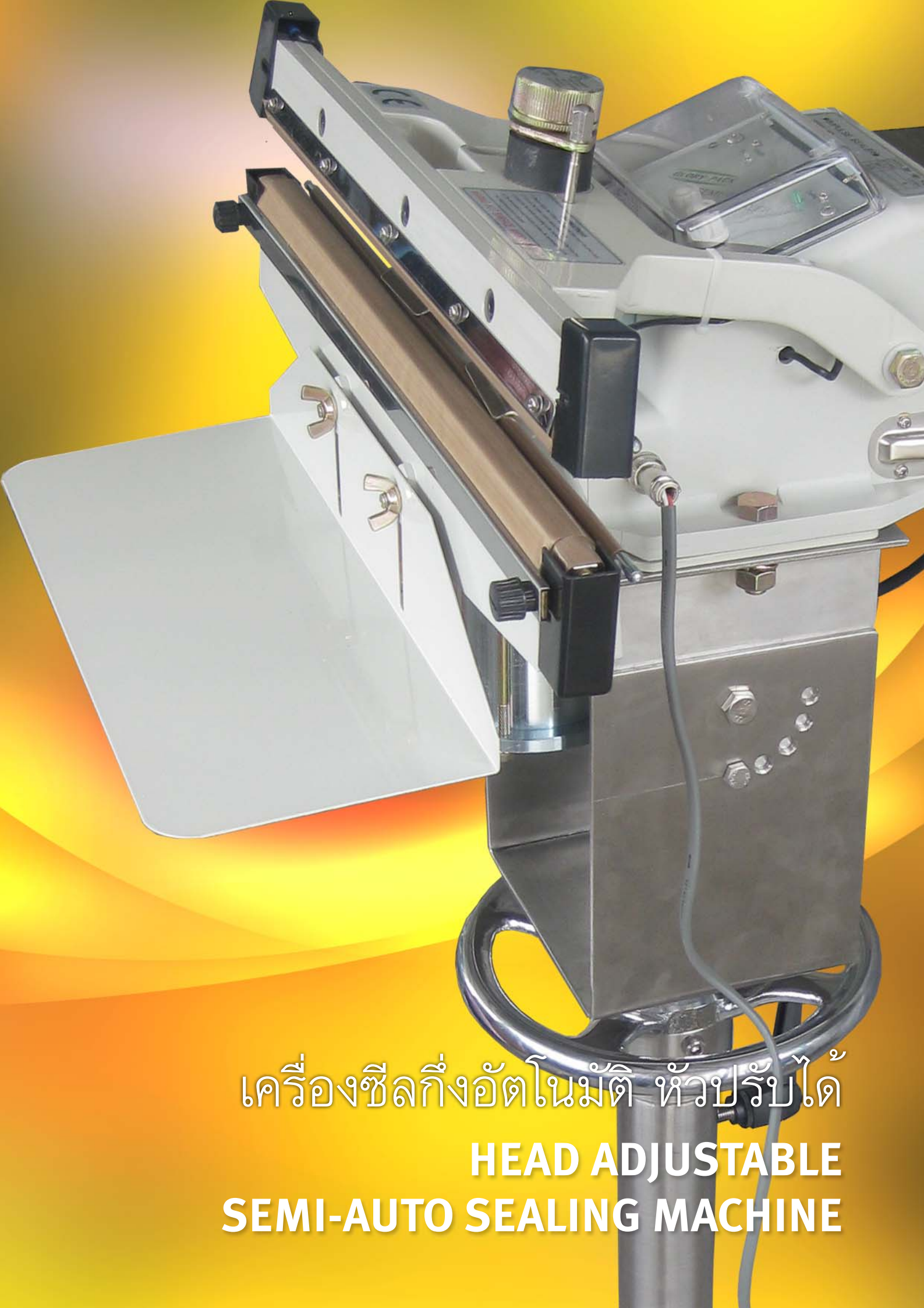
เครื่องซีลกึ่งอัตโนมัติ หัวปรับได้ HEAD ADJUSTABLE SEMI-AUTO SEALING MACHINE